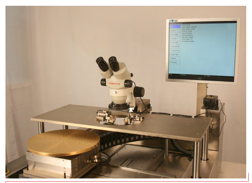
Pegasus™ S300 Platen with Pegasus™ Probes (Probe Card Holder also available)